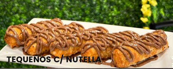
TEQUEÑOS C/ NUTELLA