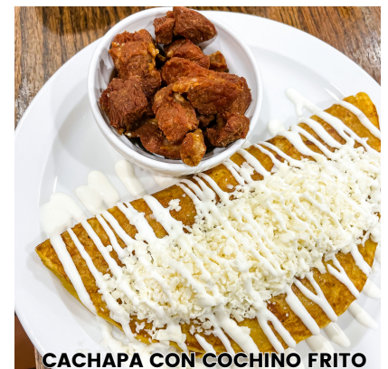
CACHAPA CON COCHINO FRITO