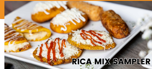
RICA MIX SAMPLER