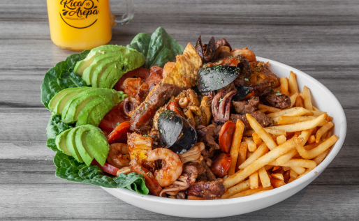
PARRILLA MAR Y TIERRA