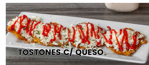
TOSTONES C/ QUESO

*Consuming raw or undercooked meats, poultry, seafood, shellfish, or eggs may increase your risk of foodborne illness, especially if you have certain medical conditions. *this items may contain undercooked ingredients