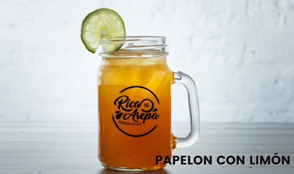
PAPELON CON LIMÓN