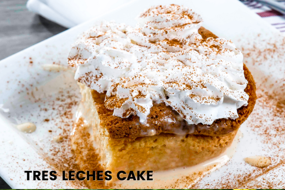
TRES LECHEs CAKE