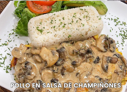
POLLO EN SALSA DE CHAMPIÑONES