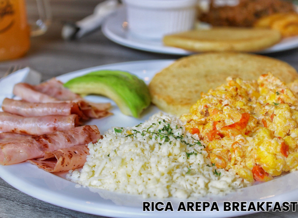
RICA AREPA BREAKFAST

RICA AREPA BREAKFAST 17 AREPA, CHEESE, SCRAMBLED EGGS WITH ONION & TOMATO, AVOCADO