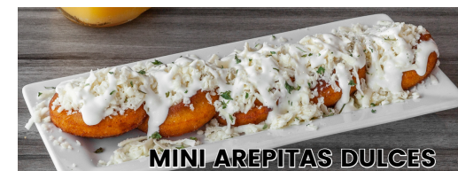
MINI AREPITAS DULCES