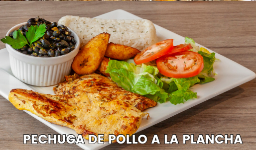
PECHUGA DE POLLO A LA PLANCHA