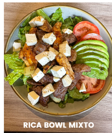
RICA BOWL MIXTO

*Consuming raw or undercooked meats, poultry, seafood, shellfish, or eggs may increase your risk of foodborne illness, especially if you have certain medical conditions. *this items may contain undercooked ingredients **this item contains soy sauce