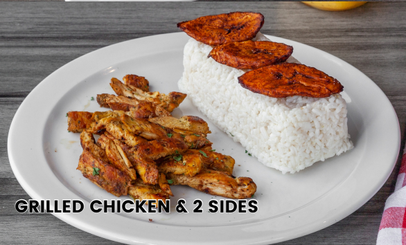
GRILLED CHICKEN & 2 SIDES